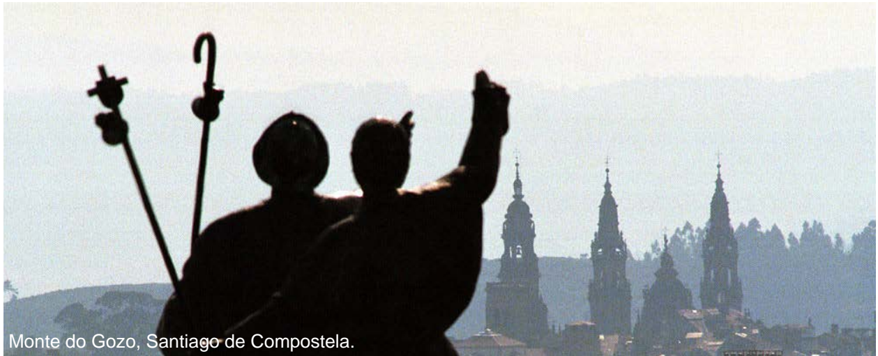
Monte do Gozo, Santiago de Compostela.